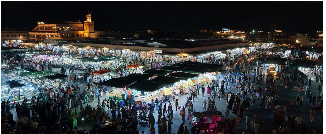
Djema el Fna at night