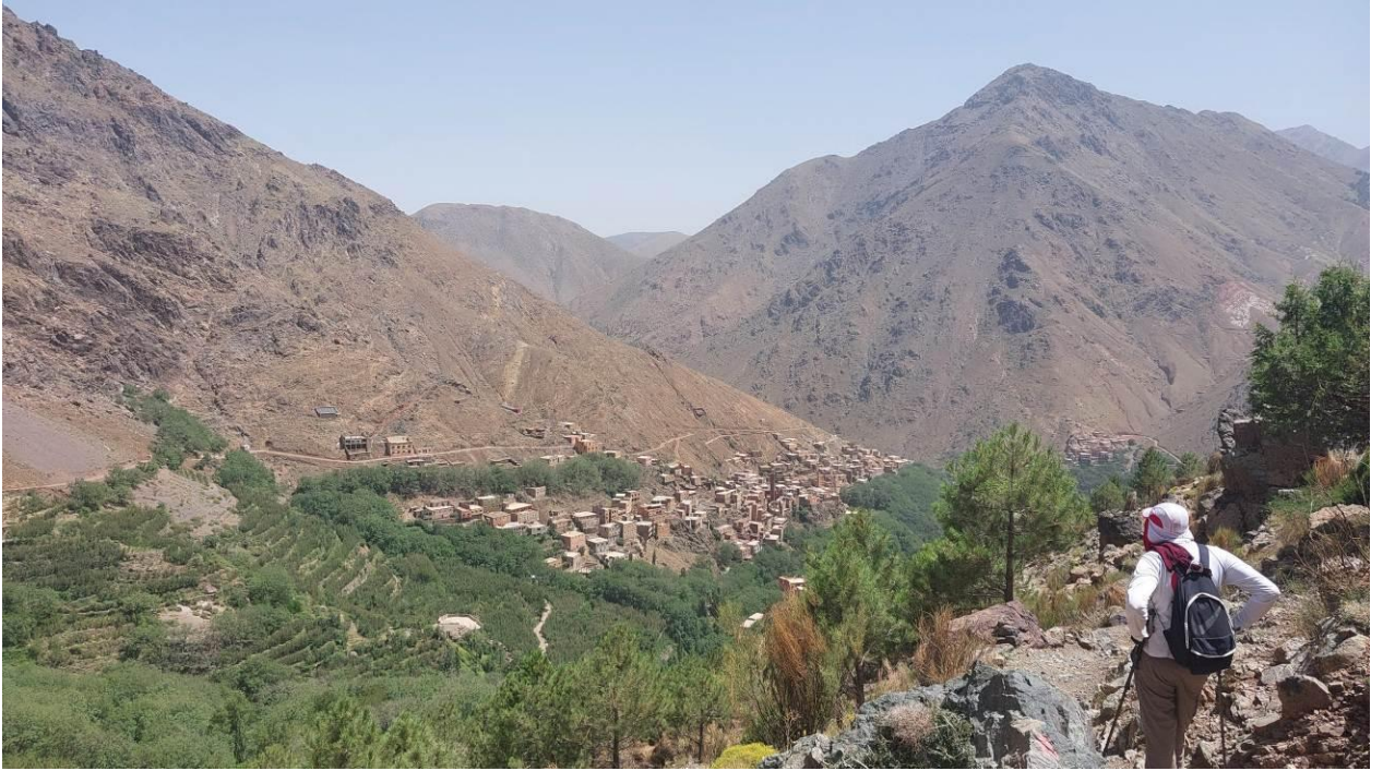
Looking down on the Berber village of Imlil