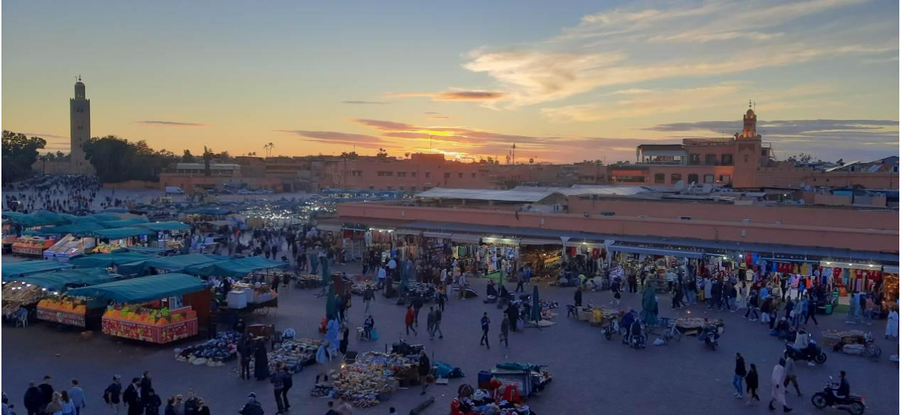
Enjoy dinner watching the sun set over Djema el Fna, Marrakech