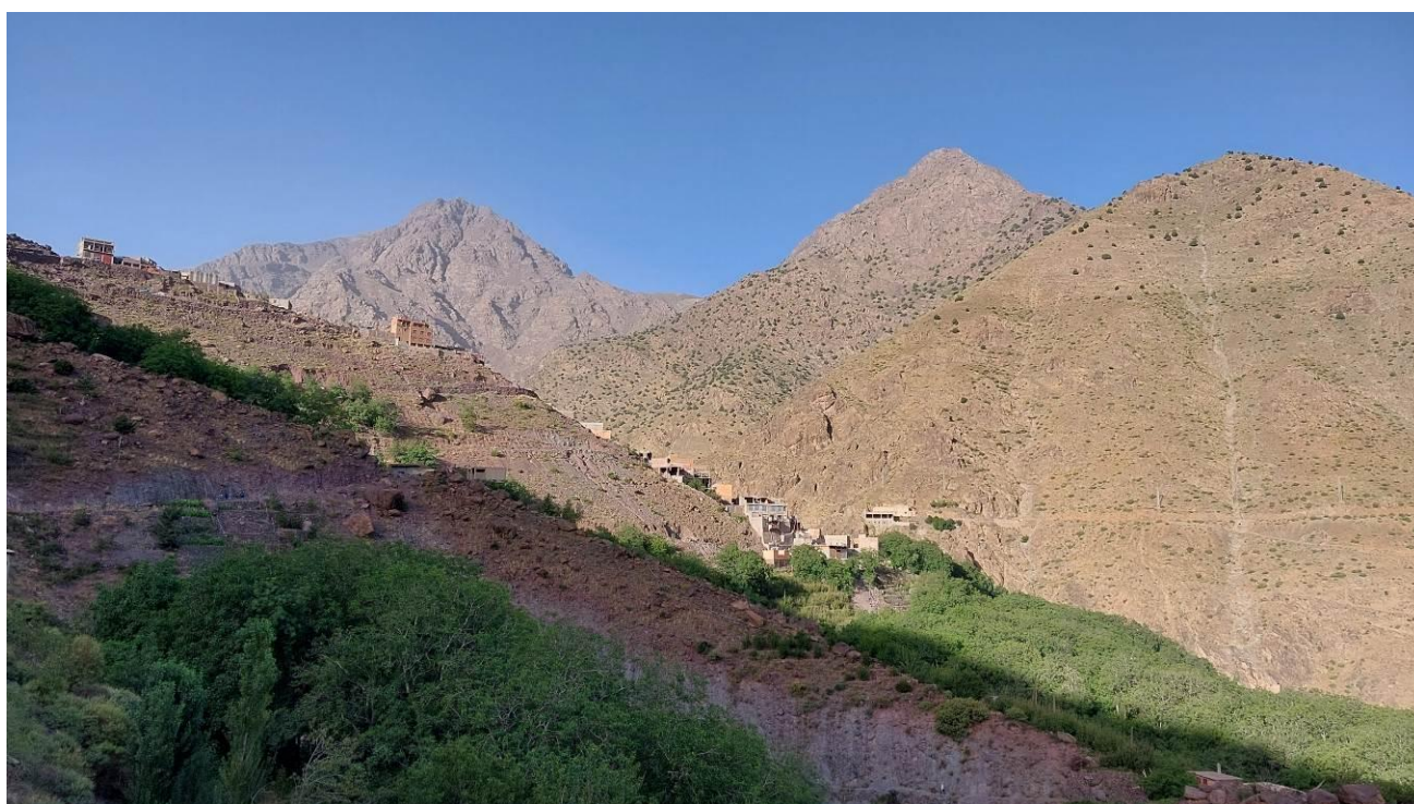
Mt Toubkal in the distance, viewed from the Berber village of Aremd