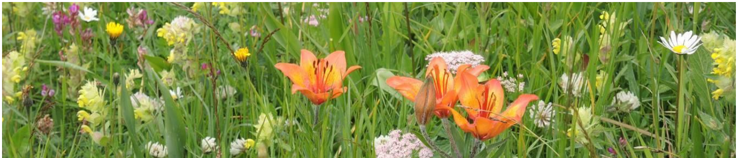
A sea of wild flowers. “When I’m in the Dolomites in July I think God spilled the seed packet here!”