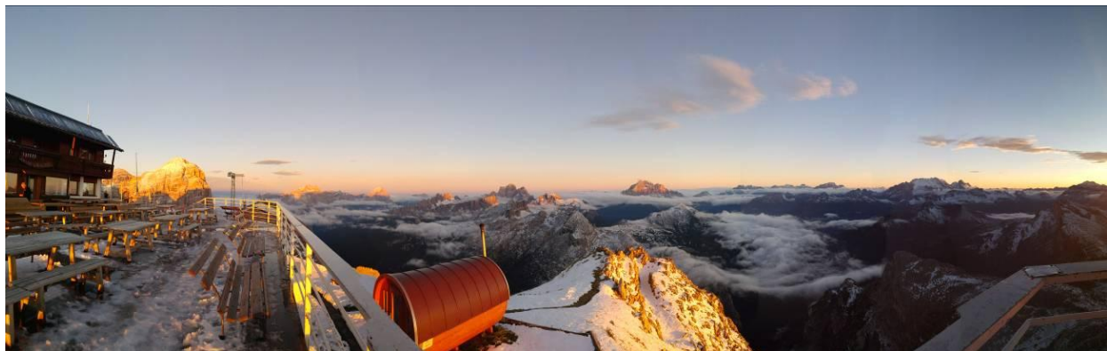
A sauna with a view...