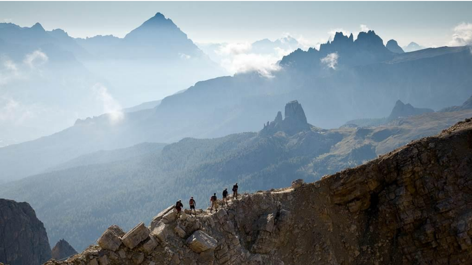
The optional ridge to the Lagazuoi tunnels

However, the ridge (shown below), is totally optional, and is not for everyone – it does require a head for heights and should definitely not be attempted in wet or snowy conditions.