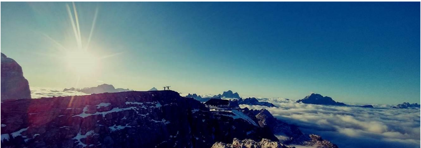
On Lagazuoi Pizo

Not sure if you'll be ok self-guided? Please email or call us – we consider it very important that you find the right trek for you, and we pride ourselves in our ability to help you find the most appropriate trek.