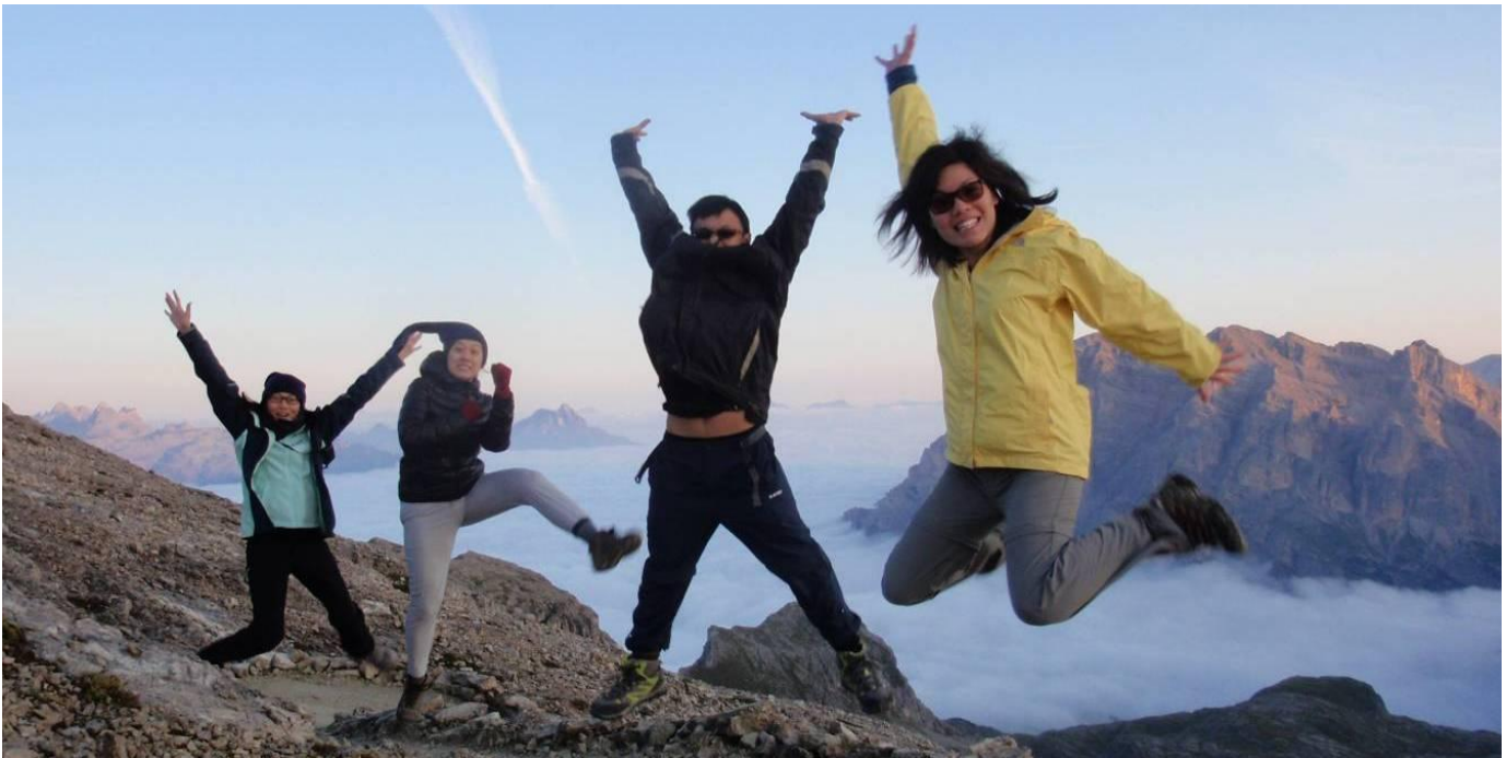
Celebrating the start of a new day – sunrise on Peak Lagazuoi